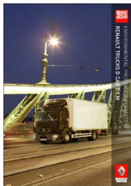
Renault Trucks D Cab 2,1 m