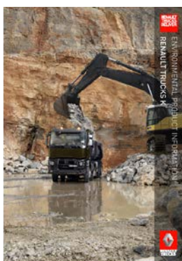
Renault Trucks K