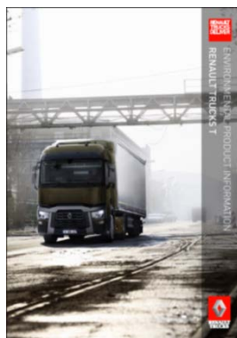
Renault Trucks T