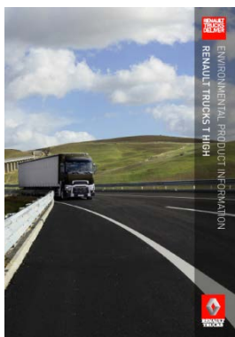
Renault Trucks T High